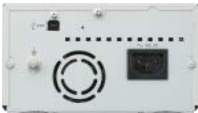
UP-D897 Rear Panel