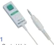
RM-91 Remote Control Unit