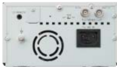
UP-897MD Rear Panel